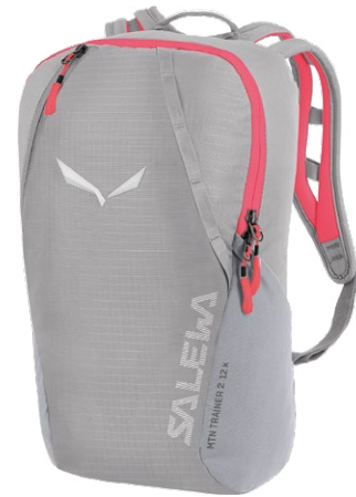
MTN TRAINER 2 12L K

Congratulations on your purchase of a Salewa backpack. We want to be sure that you understand and utilize it in the best way. On the following pages you will find a description of all functions the backpack is offering.