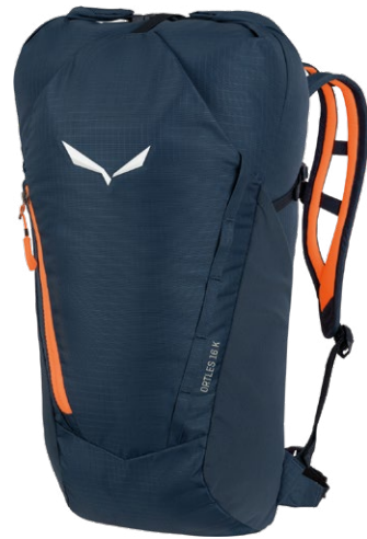
ORTLES 16L K