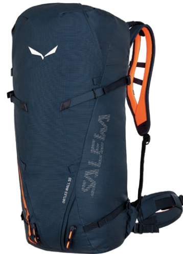
ORTLES WALL 38