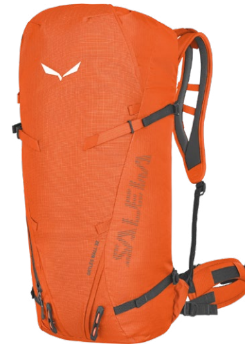
ORTLES WALL 32

Congratulations on your purchase of a Salewa backpack. We want to be sure that you understand and utilize it in the best way. On the following pages you will find a description of all functions the backpack is offering.